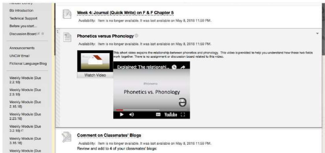
Figure 1. Online module of linguistics class.