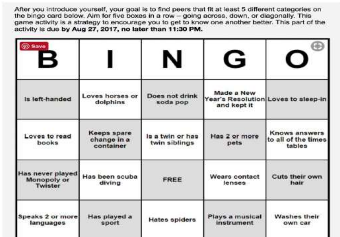
Figure 2. Example of a gamified activity in an online environment.